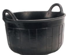
CARBONERA RUBBER BASKET N°1 (26 L) REF.88902