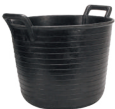
ESPUERTA RUBBER BASKET N°99 (33 L) REF.88804